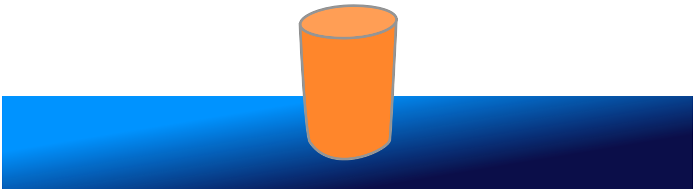
X-Ray - "X" Inflatable Cylinder As Start/Finish Pln