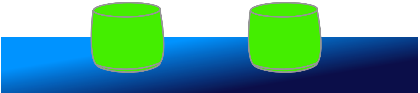
Leeward Gate Inflatable Tomato